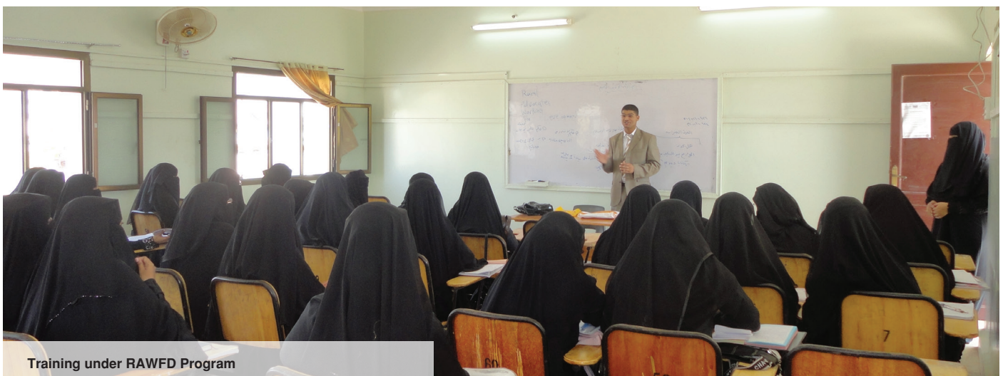
Training under RAWFD Program

Capacity Building: A six-day training course was organized on 25-31 May 2014 for in Project Management, with 23 officers from SFD's relevant units attending.