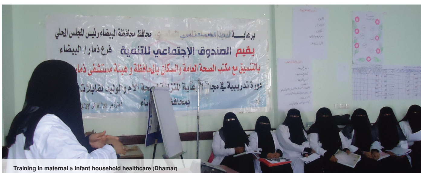
Training in maternal & infant household healthcare (Dhamar)

The SFD continued the preparations for the Maternal and Newborn Health Voucher Program (MNHVP) and Integrated Nutrition Interventions (INI). The first aims to ensure that women residing in SFD-target areas access quality healthcare services, both antenatally and postnatally, on a regular basis. The second program aims to raise parents' awareness on the ways of nourishing their children, provide referral services for malnourished children to link them to the available services.