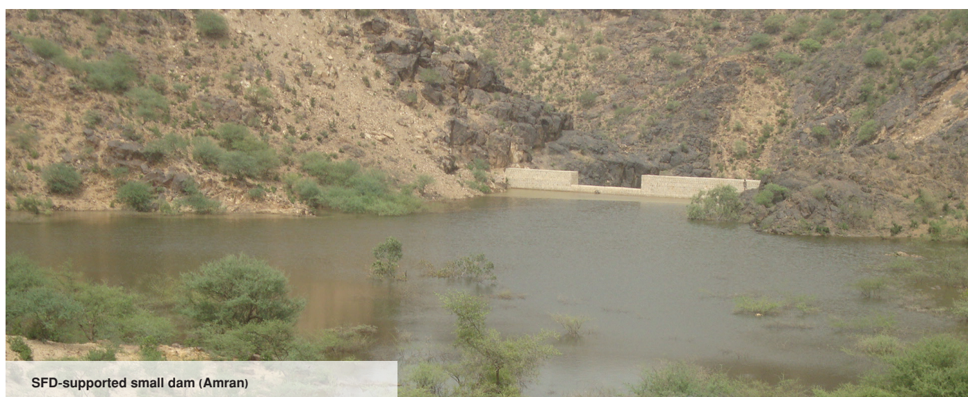
SFD-supported small dam (Amran)